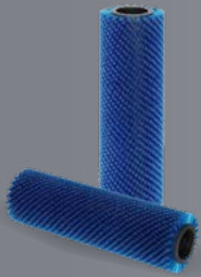
UltraBrush Soft (non abrasive)

The new UltraBrush used on the Battery machines will deliver unparalleled cleaning results