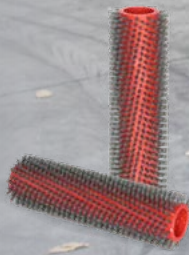
UltraBrush Max (high abrasive)